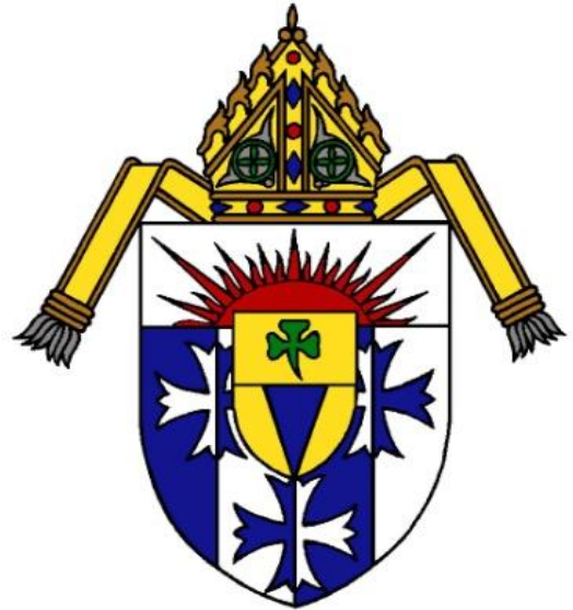
Diocese of Great Falls-Billings